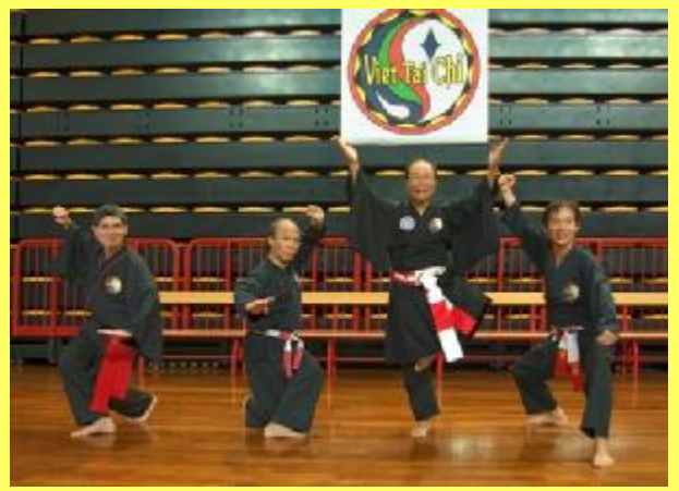
La Spezia - 2006