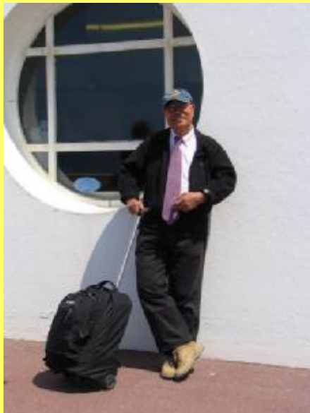
Les Sables d'Olonne -2008