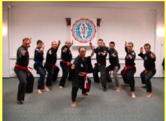
Warsaw - 2007