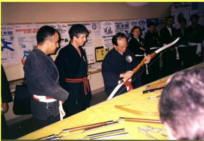
Torino - 1996