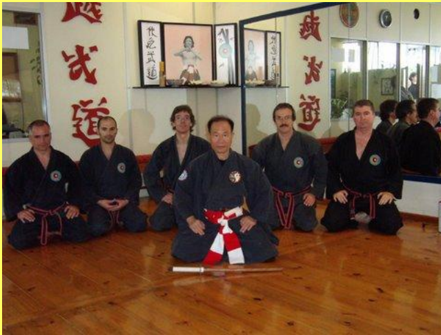
Porto - 2007