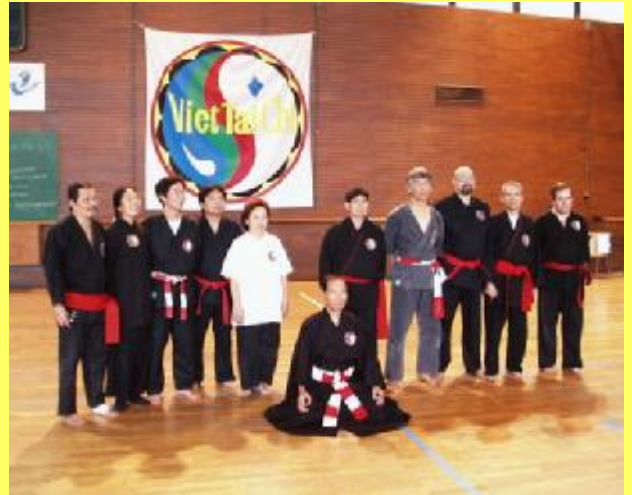
Paris - 2001