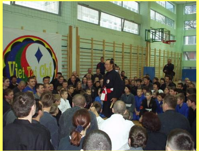
Warsaw - 2003